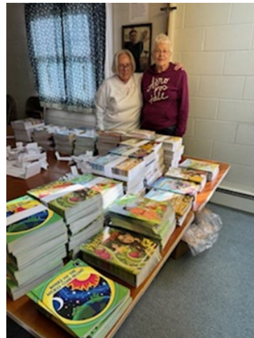
Sorting Arch books in Glendive, story on pg. 14