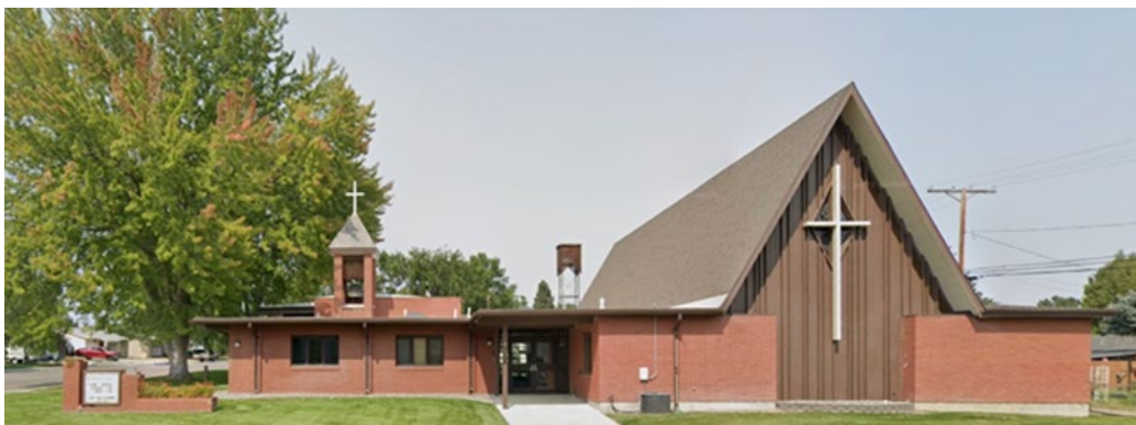
St. Johns Lutheran Church, Laurel